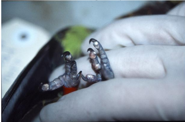
Fig 2. Articular gout- note white tophi

Hydration, Muscle mass, Fat deposits: good