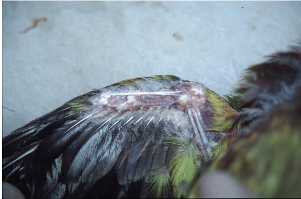
Fig 1. Articular gout- note white tophi

External findings: Abundant white, chalky material distends many joints. This white material distended the joints of the carpus, manus, spine, right hip, stifles, tarsi, metatarsi, and interphalangeal joints.